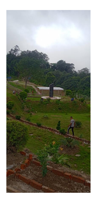
Fig. 4: Sindhuligadhi