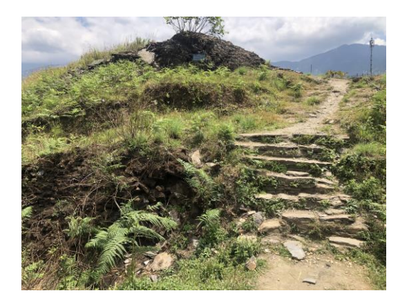
Fig. 7: Side view from Dugunagadhi