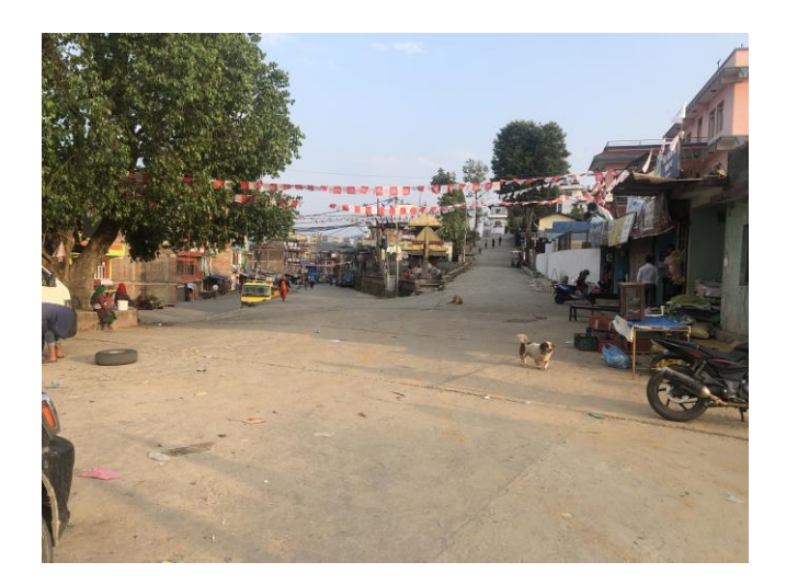
Fig. 5: Chautara Sindhupalchok

Chautara is head-quarter of Sindhupalchok district in Bagmati zone which is located in the northern part of Nepal and covers an area of around 50 square kilometers. Now, it lies in Chautara sangachowkgadi municipality. The average elevation is 1,600 metres above sea level. The largest ethnic groups are Sherpa, Newar, Brahmin, Chhetri, Gurung, Magars, Tamang, etc. The major languages are Newar, Tamang, Nepali, Nepal Bhasa and English is understood by majority of people. The major religions are Hinduism, Buddhism and Christianity. Chautara was an ancient settlement which was the center of administration as well as trade. From Chautara, people used to go Kathmandu, the capital of Nepal and returned the same way via Peepal Danda-Nawalpur – Melamchee –Kaule Dobhan – Sankhu.