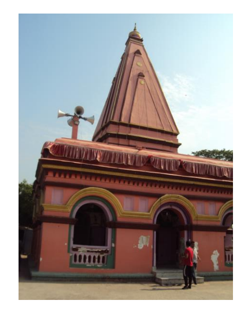
Fig. 2: Kankalini Temple