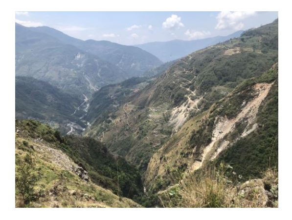
Fig. 6: Dugunagadhi Sindhupalchok