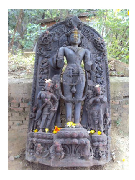
Fig. 3: Stone statue found in Simraungadh