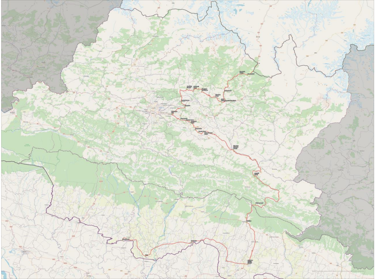
Fig. 9: Silk Road from Simraungadh to Kodari