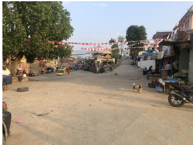
Fig. 5: Chautara Sindhupalchok

Chautara is head-quarter of Sindhupalchok district in Bagmati zone which is located in the northern part of Nepal and covers an area of around 50 square kilometers. Now, it lies in Chautara sangachowkgadi municipality. The average elevation is 1,600 metres above sea level. The largest ethnic groups are Sherpa, Newar, Brahmin, Chhetri, Gurung, Magars, Tamang, etc. The major languages are Newar, Tamang, Nepali, Nepal Bhasa and English is understood by majority of people. The major religions are Hinduism, Buddhism and Christianity. Chautara was an ancient settlement which was the center of administration as well as trade. From Chautara, people used to go Kathmandu, the capital of Nepal and returned the same way via Peepal Danda-Nawalpur – Melamchee –Kaule Dobhan – Sankhu.