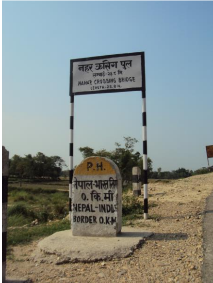
Fig. 1: India-Nepal Border