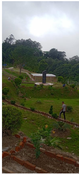
Fig. 4: Sindhuligadhi