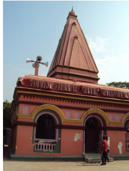
Fig. 2: Kankalini Temple