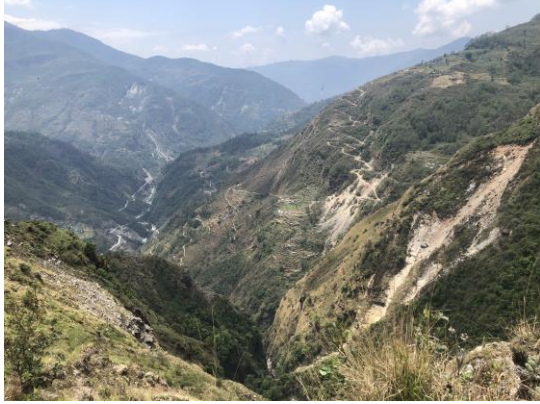
Fig. 6: Dugunagadhi Sindhupalchok