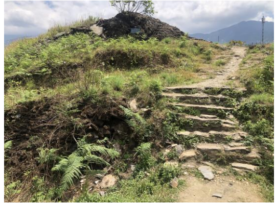
Fig. 7: Side view from Dugunagadhi