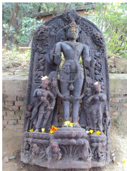
Fig. 3: Stone statue found in Simraungadh